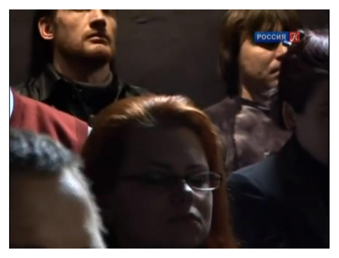
Photo. Meditation. Snapshot from a TV documentary dedicated to Theater.doc

Staying in contact with what you have received, try to name it very succinctly. Express it literally in a few words or a phrase that will capture it. Take a few minutes and open your eyes, then we will understand that you are ready".