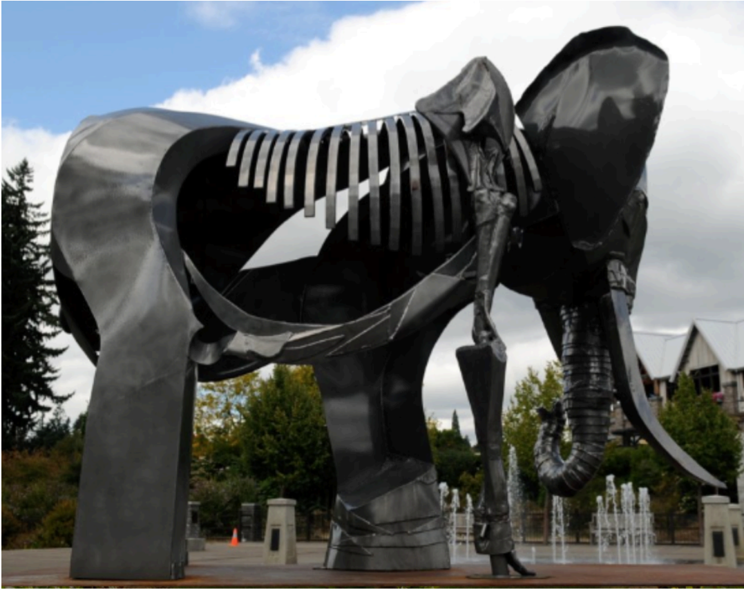
Figure 1. August Trunk, Sculpture by Alisa Formway Roe (2015).

The message from the elephant, “August Trunk”, touched me deeply and I was wondering how it is connected to my project. I wondered, what are the complex issues of the global society that I should discuss? I was debating between different topics, trying to find an answer to that question, but nothing seemed to inspire me until I decided to focus on exploring my relationship to power. Immediately after deciding, I had a new elephant-dream, which I saw as a sign telling me I’m on the right track.